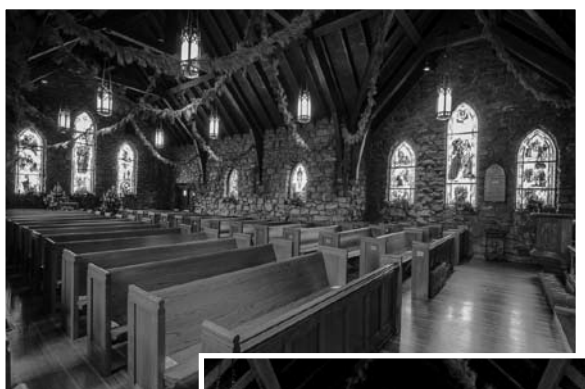
Our beautiful church at Christmas! Watch for a complete list of the donors who made this possible in the next TEAM. Our thanks to photographer Terry Barnes for these great shots.