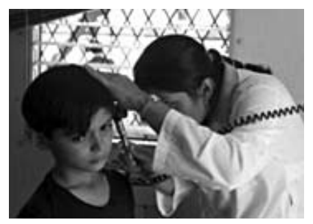
Food For The Poor provides emergency relief assistance, clean water, medicines, educational materials, homes, support for orphans and the aged, skills training and micro-enterprise development assistance. Since its inception, Food For The Poor has completed more than 1,188 water projects.