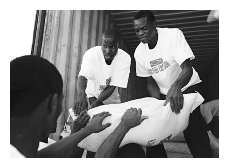
In 2010, Food For The Poor shipped 4,389 containers of aid and built 9,460 new housing units in the countries they serve. A fruit tree program started in 2007 has resulted in the planting of more than 585,000 fruit trees in Haiti and Jamaica.

This year during Lent, we'll have the opportunity to fill "Operation Starfish" mite boxes in support of the work being done by Food For The Poor. The motto for this project is, appropriately, "saving one life at a time." We encourage you to visit their extensive web site (www.foodforthepoor.org) where you can explore the multitude of efforts being made by Food For The Poor on behalf of "the least of us."