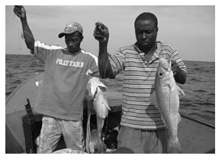
Micro-enterprise programs include fishing village empowerment, animal husbandry, agricultural development, fish farming, and programs for women such as sewing, baking and embroidery classes.

Mark your calendars now and please join us February 23 to welcome Food For The Poor and to hear firsthand about the many ways in which we may participate in this vital and exciting ministry.