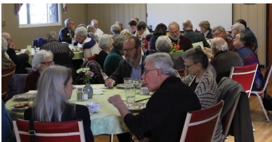
An excellent turnout!