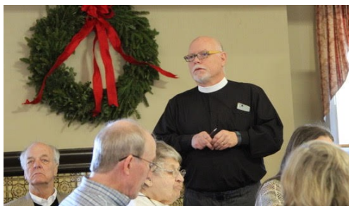
Plenty of business to discuss.