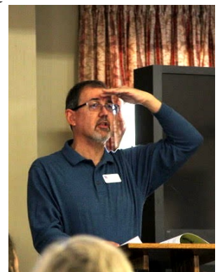
Our future looks bright!