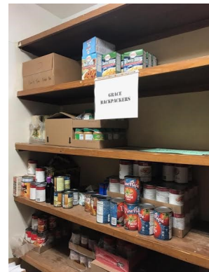
Keeping the Backpackers pantry stocked is an on-going challenge.