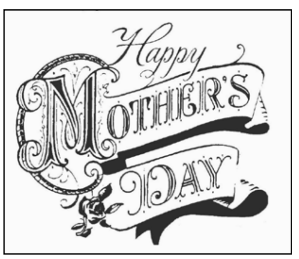
MOTHER'S DAY IS Sunday, May 10. Thanks, Mom, For All You do. You're the best!