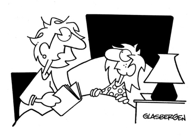
"Yes, the disciples followed Jesus... but not on Twitter."