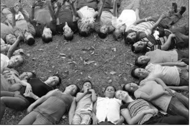
The group from the workshop in Santa Clara.

lying political issues that are at play and that are affecting these groups.