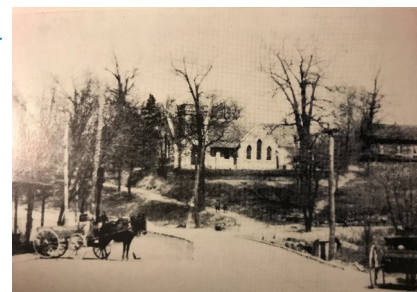
Our oaks have been lining Merrimon Avenue since horse and buggy days.

COME CELEBRATE OUR TREASURED TREE. Join us for a pot-luck brunch on Sunday, November 24 at 9:30 to help us celebrate our "Treasured Oak Tree" designation by Asheville Greenworks. Our newly formed Garden Guild