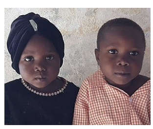
These are two of the many children in the Consider Haiti program

Haitians have been living in poverty, scarcity and corruption for a very long time. The country is perennially the poorest in the Western Hemisphere. These children deserve and desperately need long-term support. Can we here at Grace Church help?