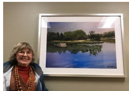
“Morning at the Lake” hangs in the new wing at Memorial Health