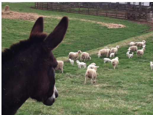
Even Miss Lola the donkey takes the Shepherds' Ministry seriously as she faithfully watches over her flock at Warren Wilson College.

Please note that plans are contingent upon the state allowing camp to open. All signs point to yes right now, but things could change. Keep watching for updates about any changes that impact the ability to operate camp this summer. If camp must remain closed, full refunds will be offered.