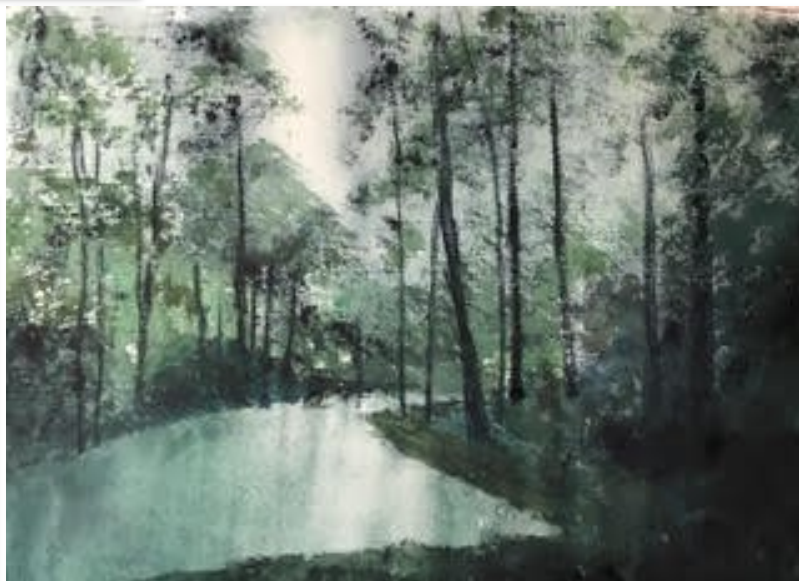
“Rain Reflections” Won “Best in Show” this past February in a show at 310 Art.

Please share your works of art with Grace at graceavl.com