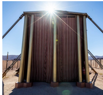
Tabernacles created sacred spaces that called people to prayer and to care for their neighbor.