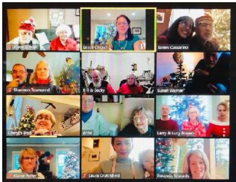
Christmas Hymn Sing