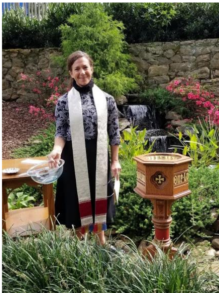
Baptism in the garden.