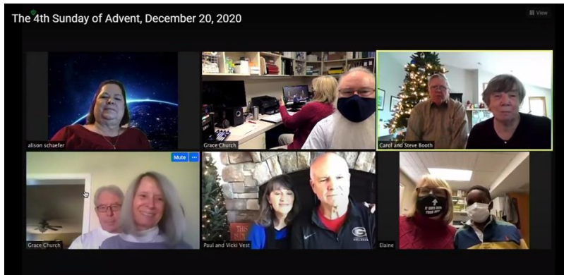
A live "Zoom Peace" on the 4 th Sunday of Advent.