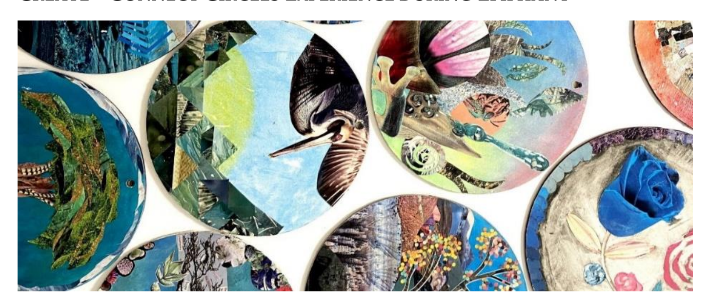
Thursdays from 8-9am at Grace Church, January 13, 20, 27, and February 3

Join Ginger Huebner for a four week Create + Connect Circles experience during Epiphany, as we enter 2022. We will gather in person in the parish hall to share, reflect and connect in response to the weekly sermon and readings through Ginger's Create + Connect process. This process guides participants by using simple tools of collage and color to interpret ideas and emotions that are often beyond words. There is no artistic experience necessary. ALL are welcome! All materials provided.