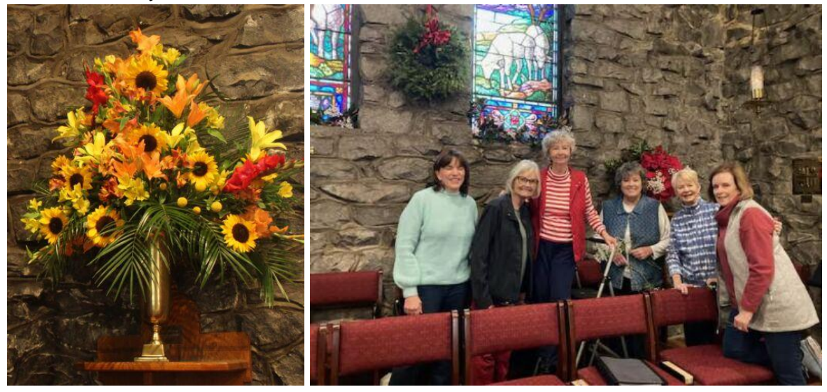
Flower Guild Ministry